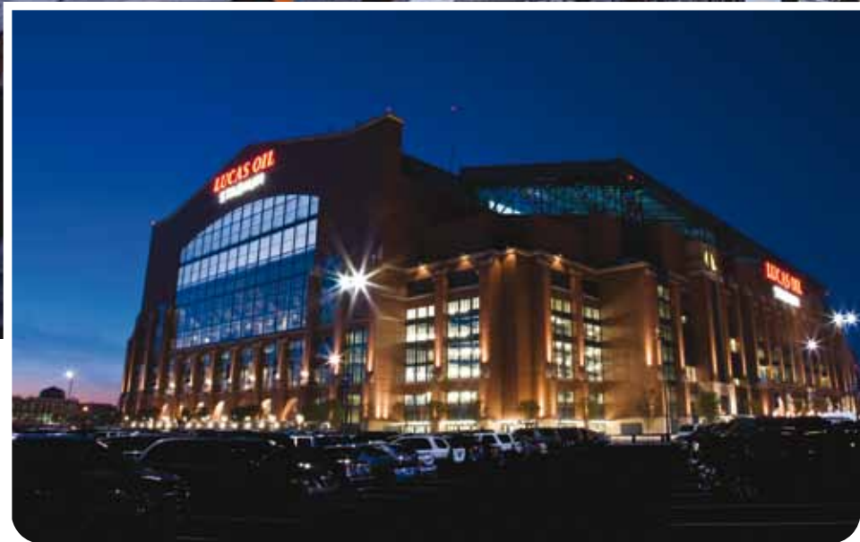
Lucas Oil Stadium Indianapolis, Indiana

On a collegiate level, Hirschfeld has successfully completed stadiums and arenas such as Darrell Royal Stadium at The University of Texas, John Paul Jones Arena at the University of Virginia, Penn State Convocation & Events Center at Penn State University, and Scharbauer Sports Complex in Midland, Texas.