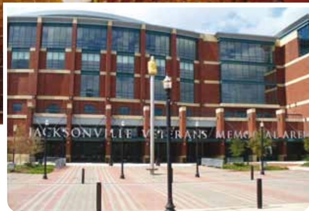
Jacksonville Veterans Memorial Arena Jacksonville, Florida