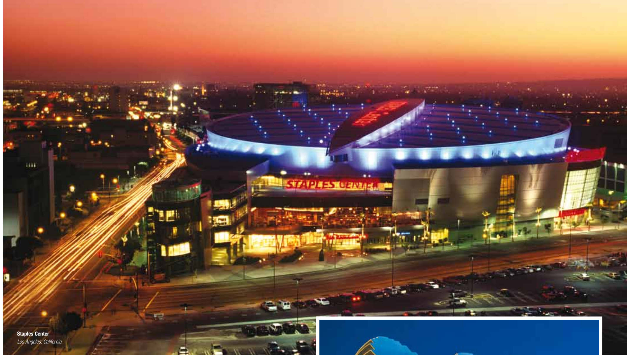
Staples Center Los Angeles, California