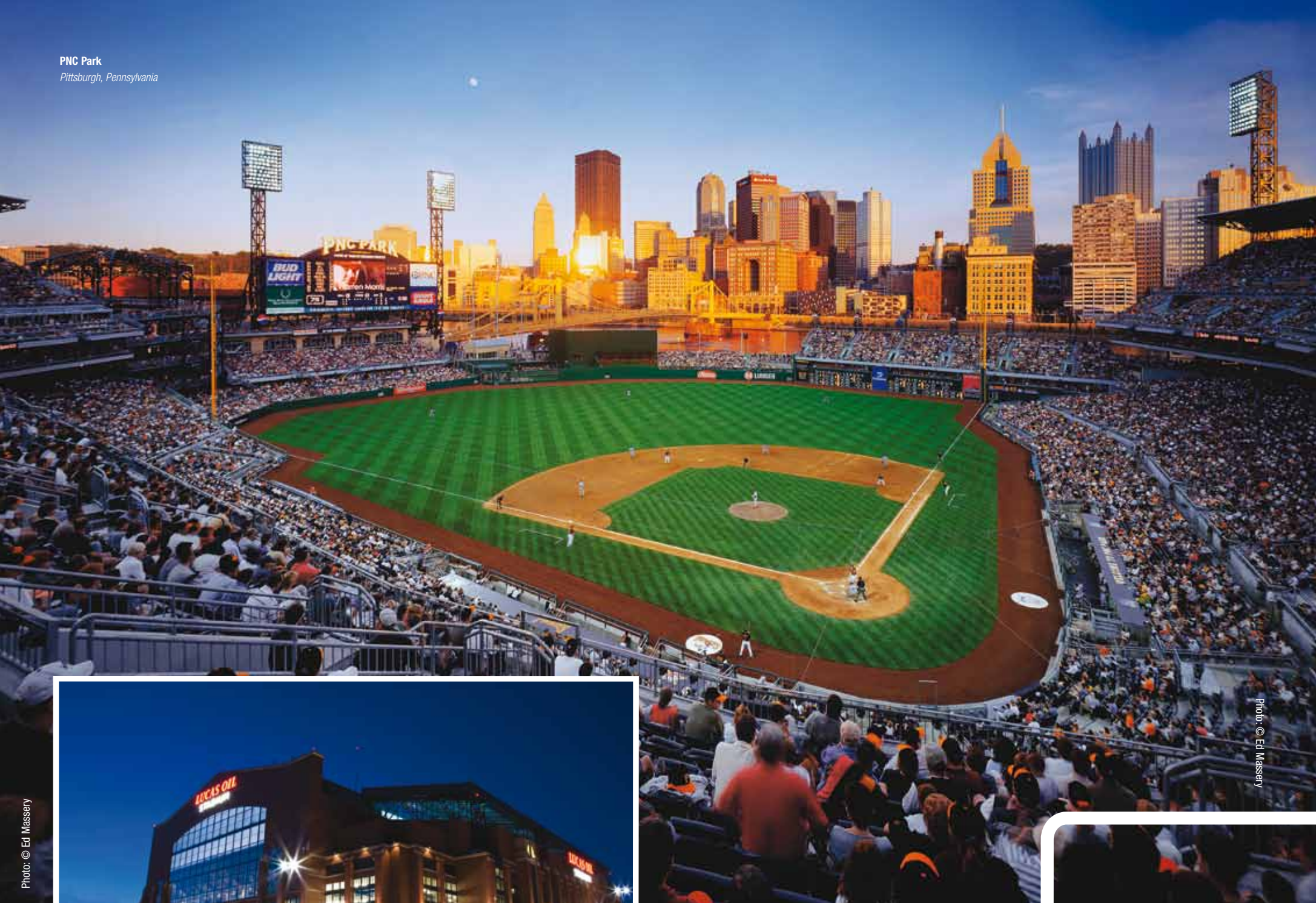
PNC Park Pittsburgh, Pennsylvania