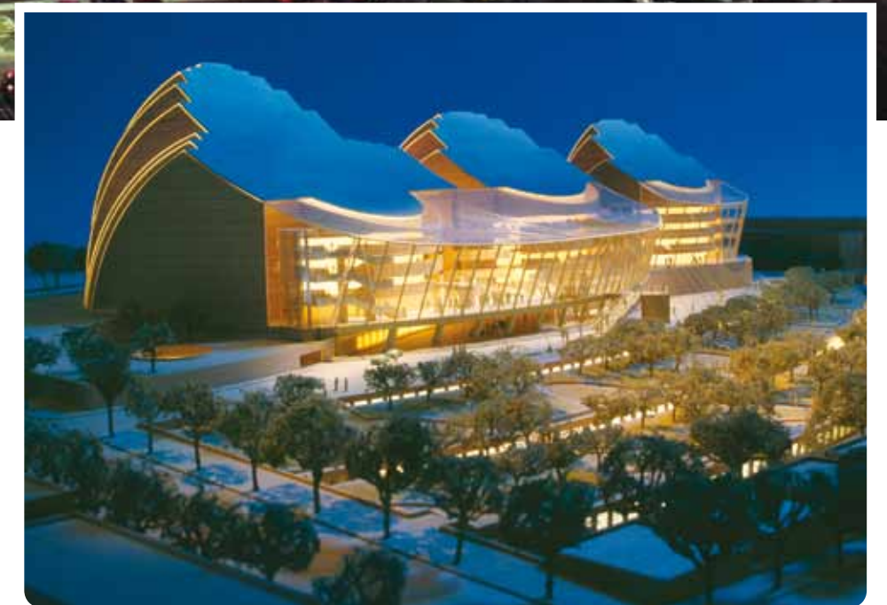
Kauffman Center for the Performing Arts Kansas City, Missouri