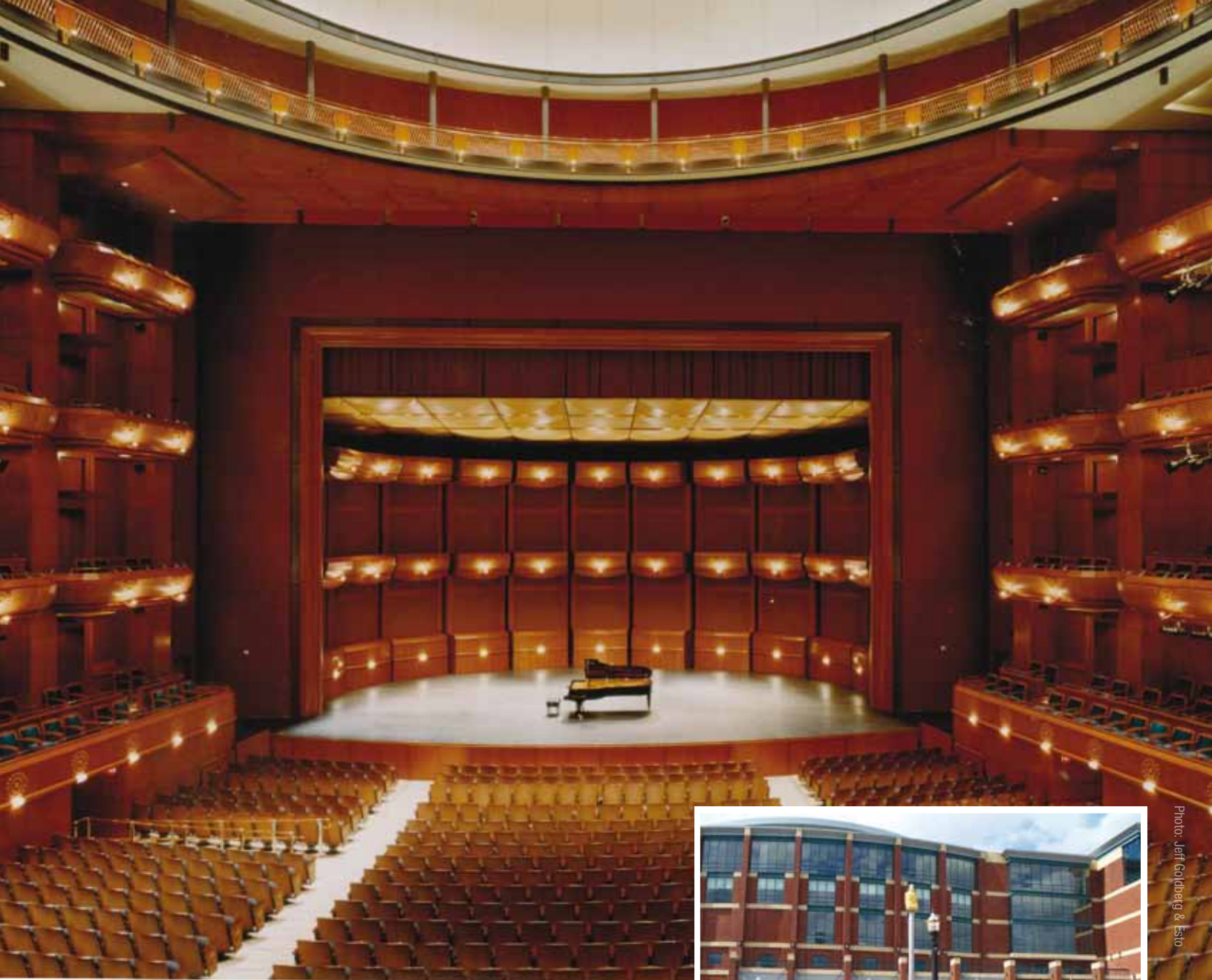
New Jersey Performing Arts Center Newark, New Jersey