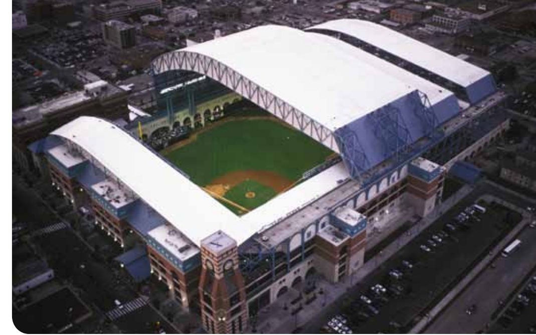
Minute Maid Park Houston, Texas